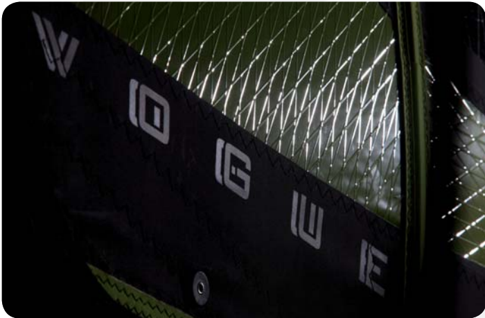
The lower part of the sail, with heavy duty Dacron reinforcements are overlapped onto bullet proof x-plys.