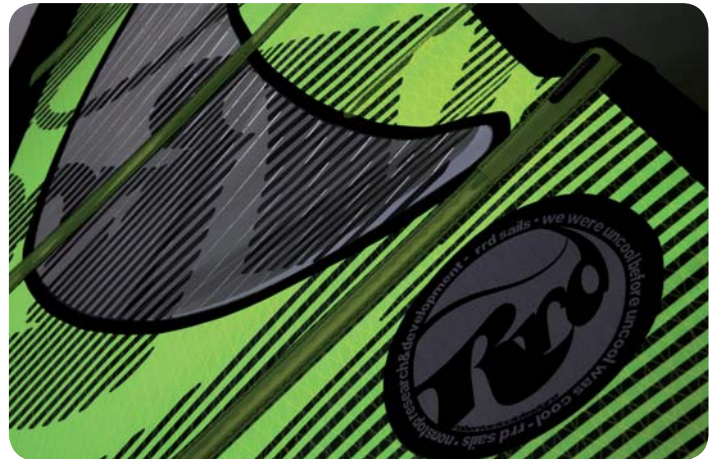
The top section of the sail is now lighter in weight, thanks to the use of an x-ply window.