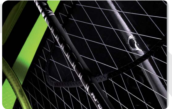
The new window area made with two different x-ply materials.