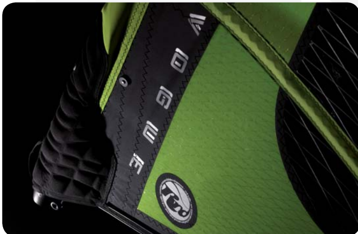
The new incorporated mast protector allows the uphaul external attachment.