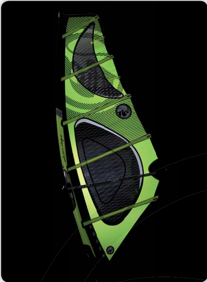
The moderate aspect ratio outline of the wave vogue. Perfect balance for waveriding.