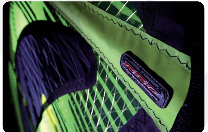
The batten ends PVC reinforcements. A sign of durability and RRD quality distinction.