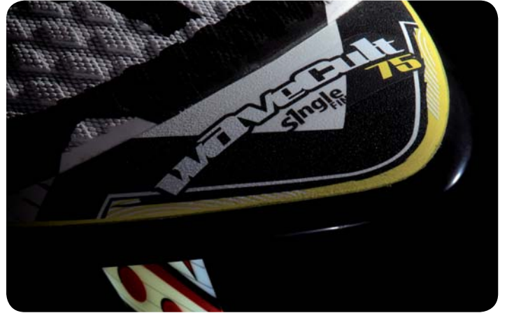
Thin and sharp tail rail line