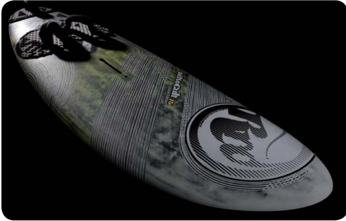
Far forward max width with wide nose configuration