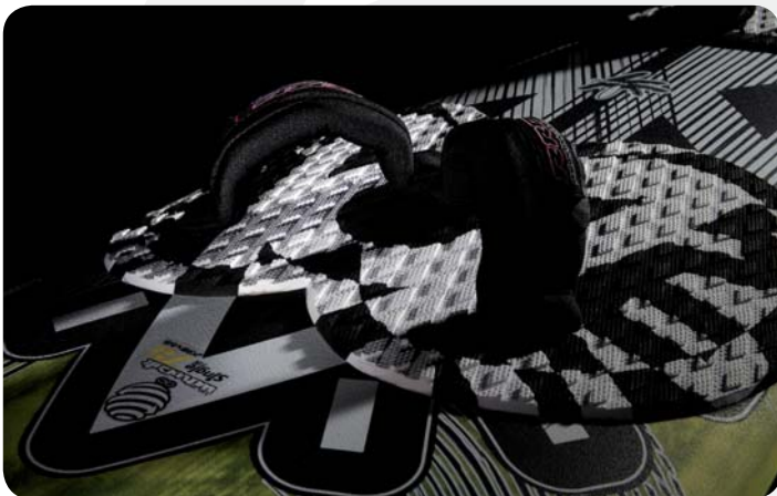
The deck features extra comfort with new 8mm pads and Da Kine straps