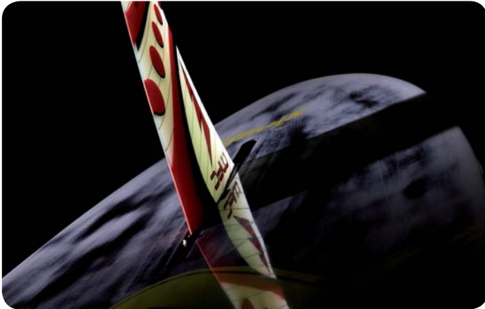
Single Fin configuration allows to maximize grip and control