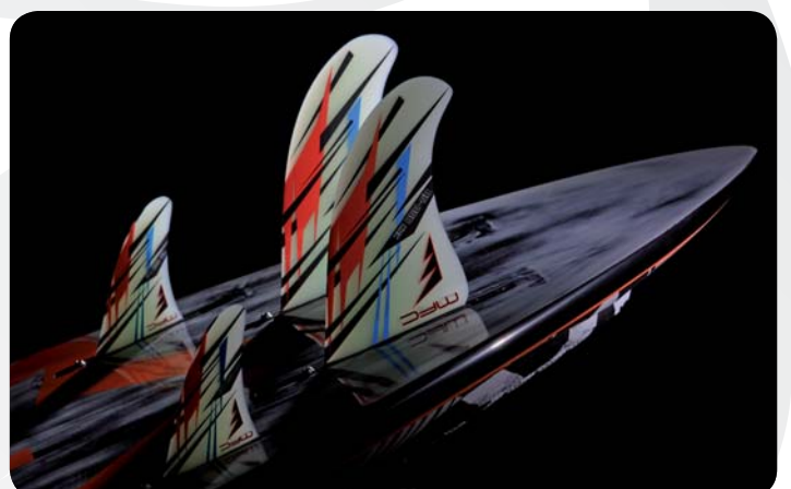
Quad fin set up allows the boards to have looser bottom turns and very sharp precise top turns