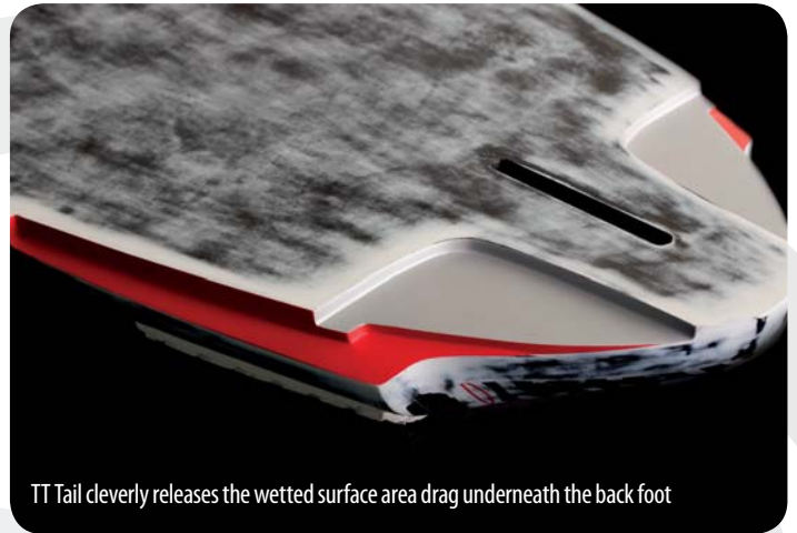
TT Tail cleverly releases the wetted surface area drag underneath the back foot