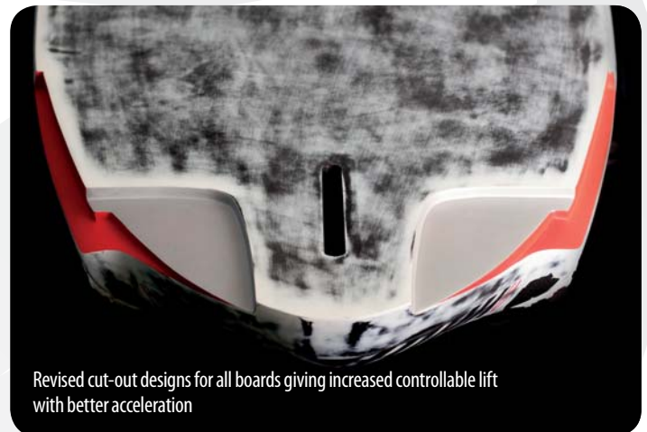
Revised cut-out designs for all boards giving increased controllable lift with better acceleration