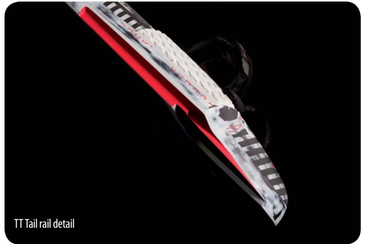
TT Tail rail detail