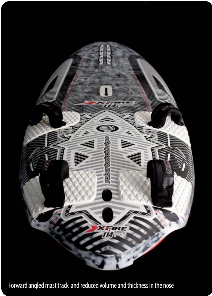
Forward angled mast track and reduced volume and thickness in the nose