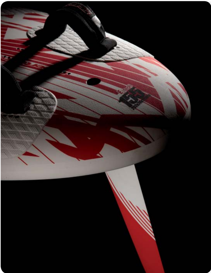
Tail rail line