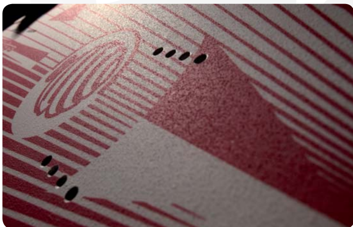
Detail of central inserts positions