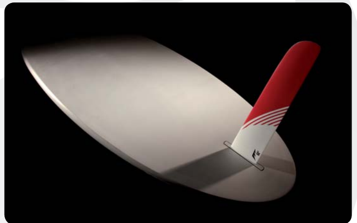
Fire Ride E-Tech are equipped with fins MFC ZX