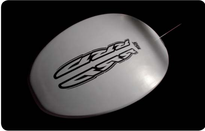
The scoop rocker line has been developed in order to improve planning and reduce impact with chops